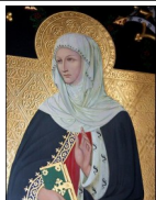
St Mary Salome

18th St Luke, Evangelist, wrote Gospel & Acts 19th Sts John de Brebeuf & Isaac Jogues & Companions, Martyrs (d1640); St Peter of Alcantara, Priest (1499-1562) 20th St Paul of the Cross, Passionists Founder (1694-1775) St Cornelius, Centurian (1st Century) 22nd St Mary Salome, Mother of Apostles James & John 23rd St John of Capistrano, Priest (1386-1456) 24th St Mary Anthony Claret, Bishop (1807-1870)